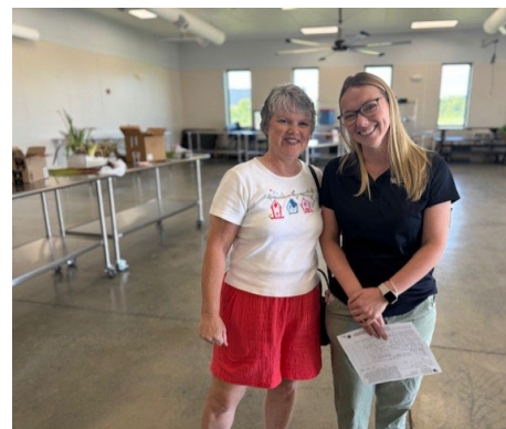
Plant Swap 2025