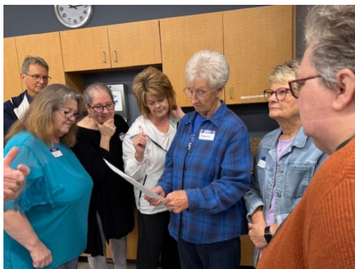
In the Face of Disaster Leader Lesson Escape Room Activity